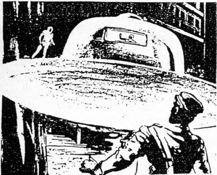
'Martians' in Milan.

"About a metre in height, dressed in a one-piece fluorescent silvery suit and with metal helmets on their heads, they descended (so says a night-watchman) in the yard of a warehouse..."